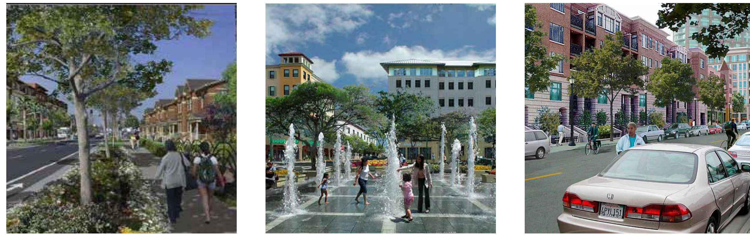
The pictures from left to right represent an increasing scale of density/intensity. Images on the right are likely only to occur in urban areas like Modesto.