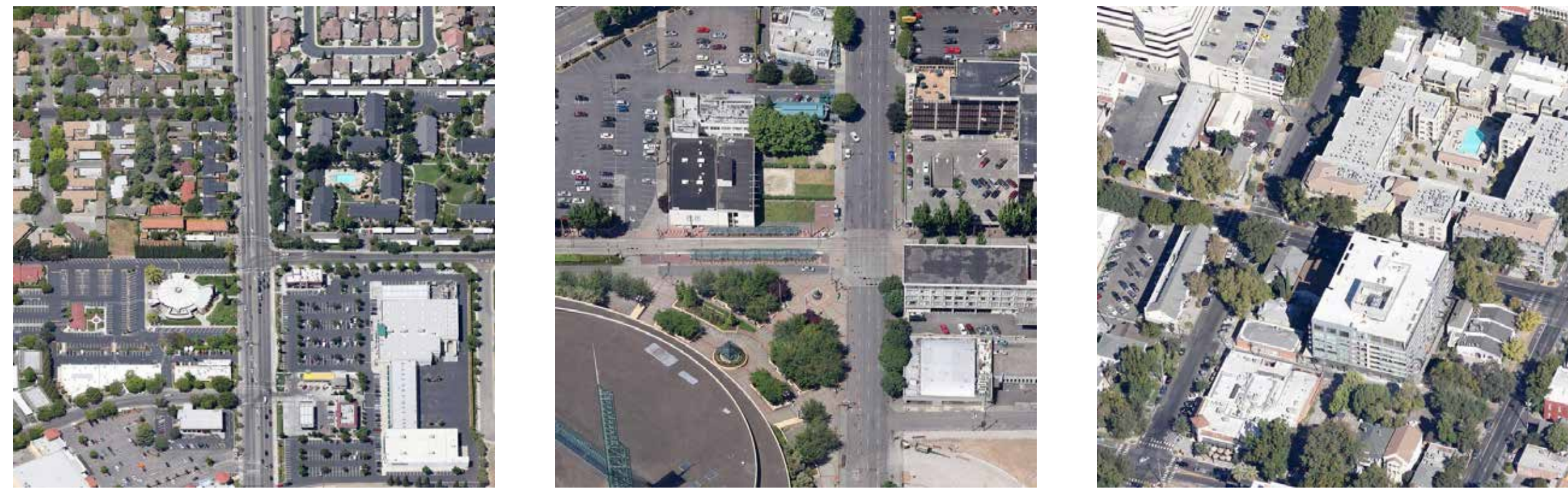
The pictures from left to right represent an increasing scale of density/intensity. Images on the right are likely only to occur in urban areas like Modesto.