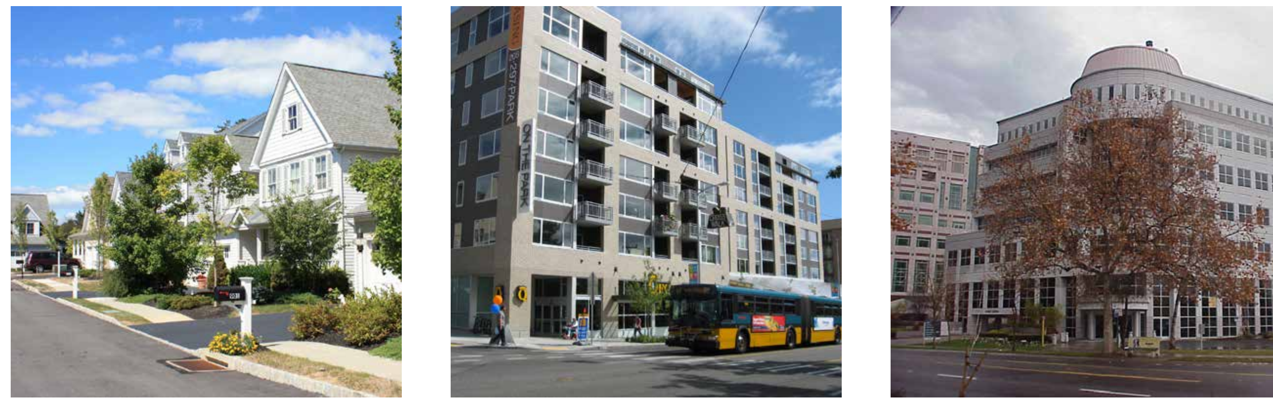
The pictures from left to right represent an increasing scale of density/intensity. Images on the right are likely only to occur in urban areas like Modesto.