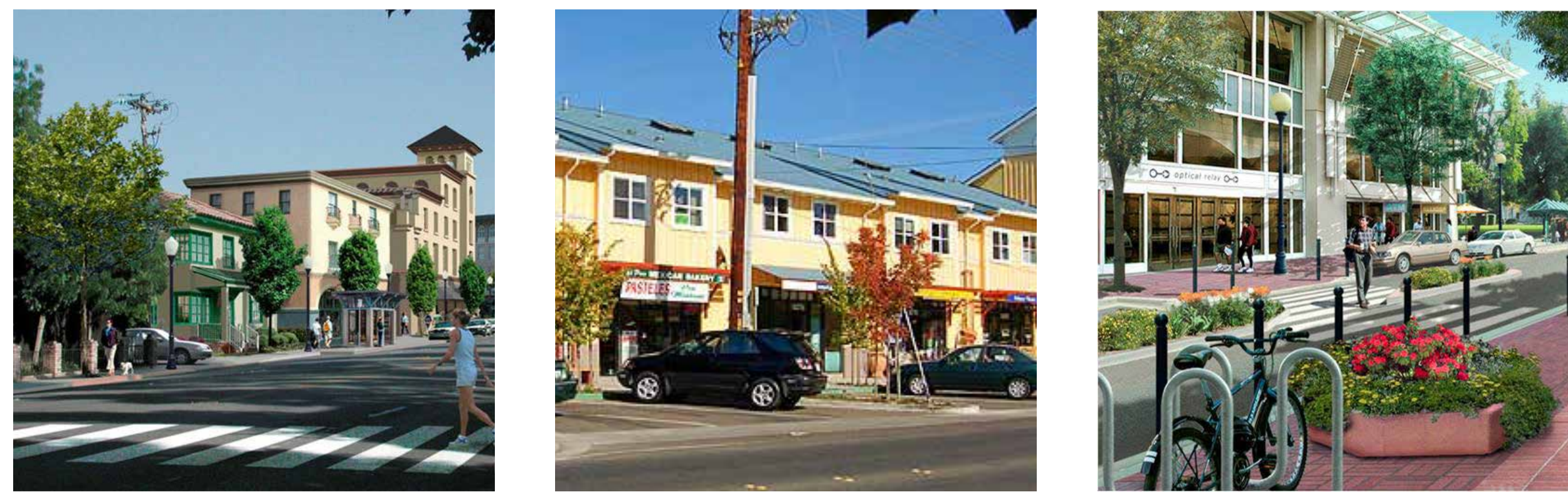
The pictures from left to right represent an increasing scale of density/intensity. Images on the right are likely only to occur in urban areas like Modesto.