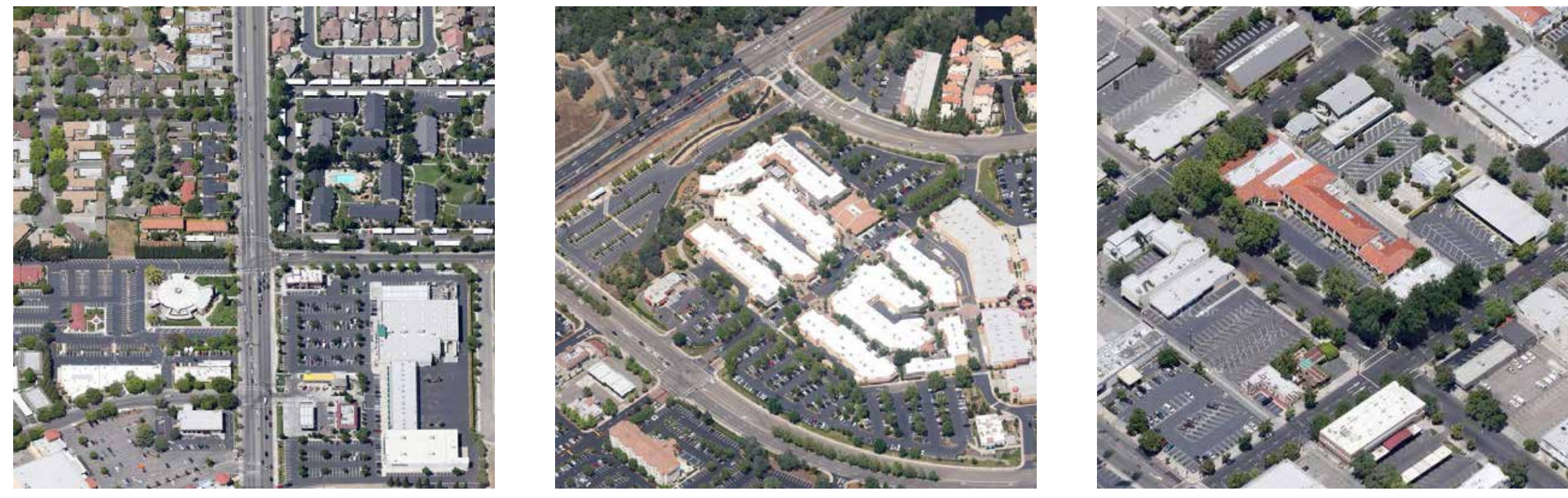
The pictures from left to right represent an increasing scale of density/intensity. Images on the right are likely only to occur in urban areas like Modesto.