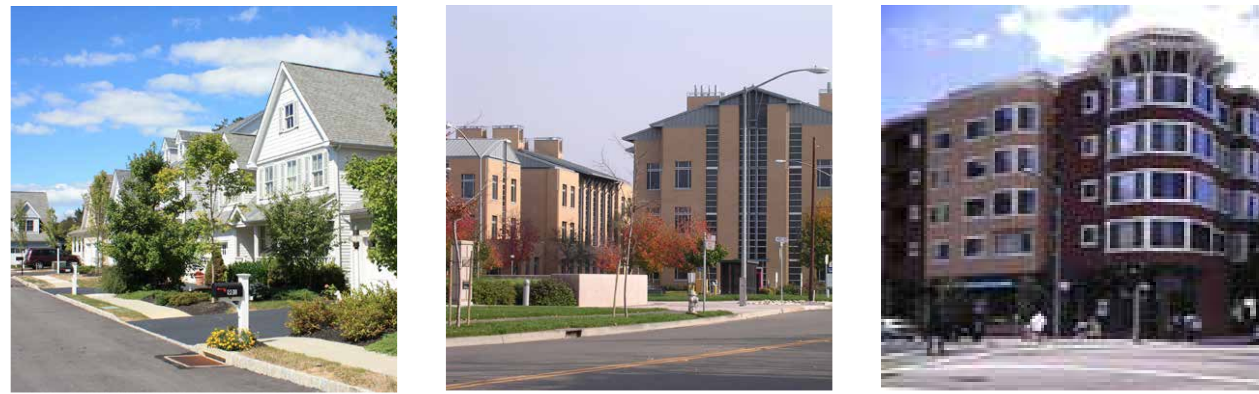
The pictures from left to right represent an increasing scale of density/intensity. Images on the right are likely only to occur in urban areas like Modesto.