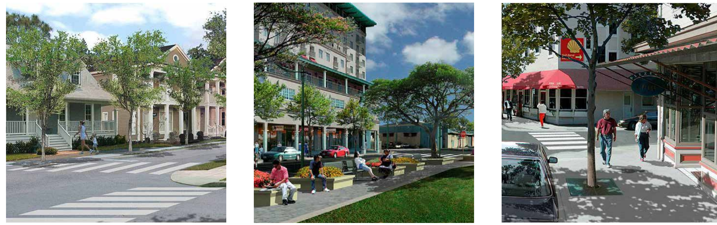
Development occurs as envisioned by locally-adopted plans.