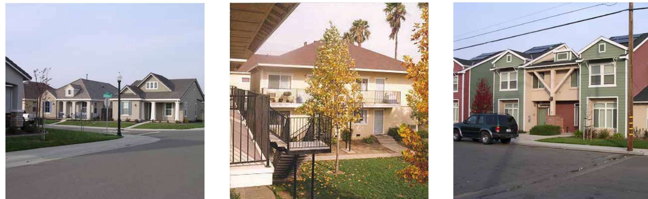
Development occurs as envisioned by locally-adopted plans.