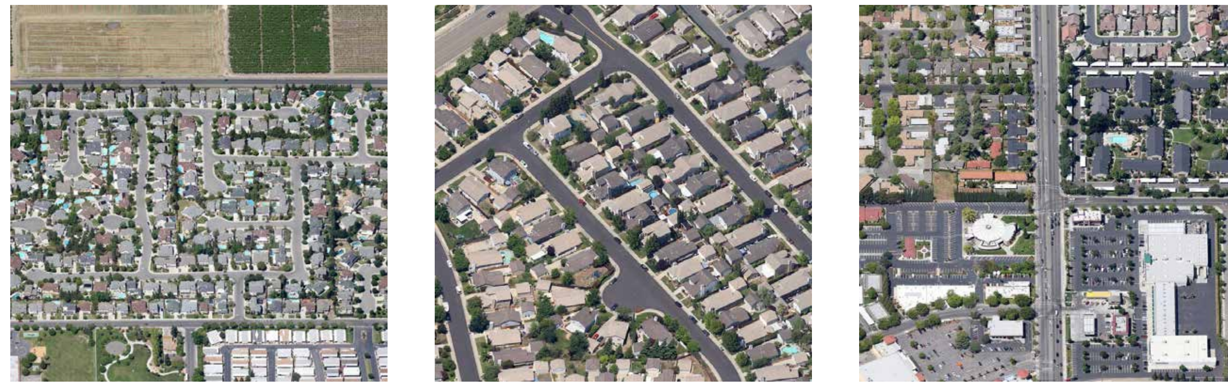
Development occurs as envisioned by locally-adopted plans.