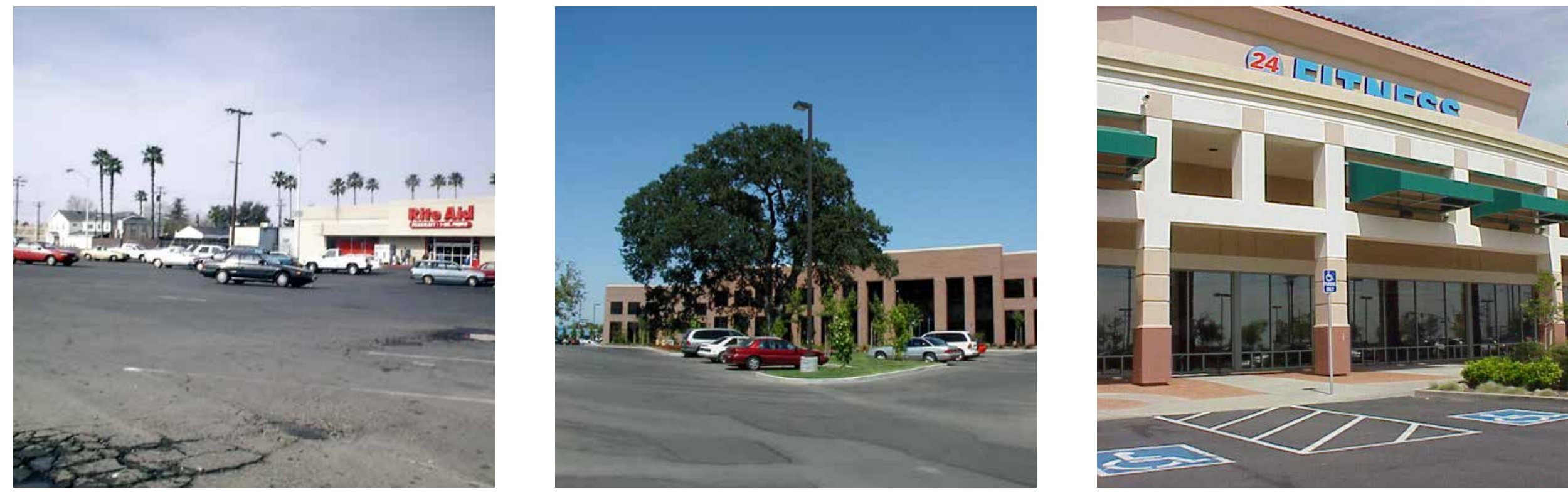
Development occurs as it has in the past.