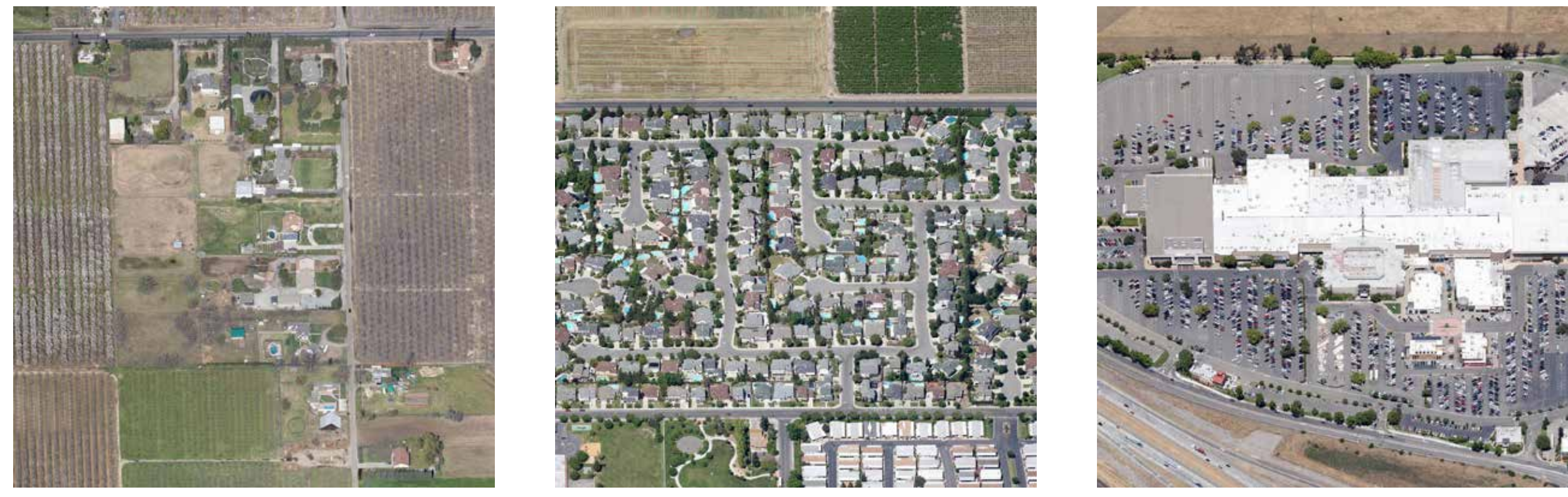
Development occurs as it has in the past.