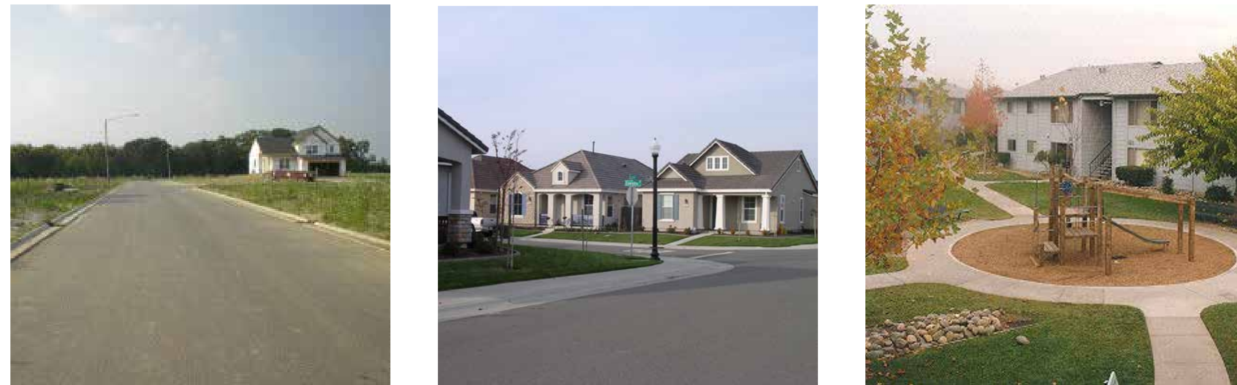
Development occurs as it has in the past.